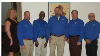
FEAA Director and Instructors